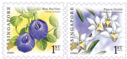
Complete set of stamps (Price: S$0.52)