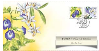
Pre-cancelled First Day Cover affixed with complete set of stamps (Price: S$1.20)