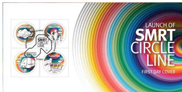
Pre-cancelled First Day Cover affixed with complete set of stamps (Price: S$5.05)

This set of four commemorative circular stamps presents a miniature exhibition of the Circle Line system - the Circle Line system map on the map of Singapore (1 st Local), a new Circle Line station (S$0.80), the new three-car Circle Line train (S$1.10) and the new Circle Line Operation Control Centre situated in Kim Chuan Depot (S$2.00) – the world's largest underground depot for trains.